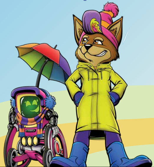
STRIDER & VIV, ODOT'S SRTS MASCOTS

www.oregonsaferoutes.org/competitive-construction-grants .