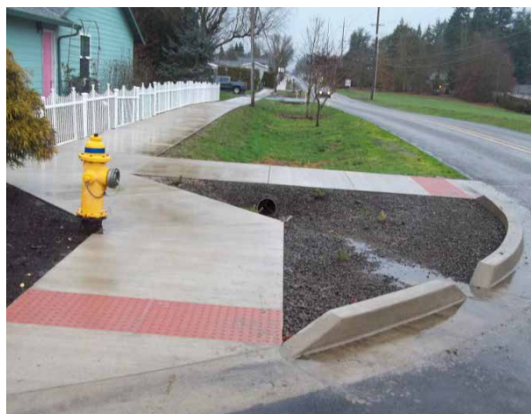
City of Dayton completed SRTS construction project.