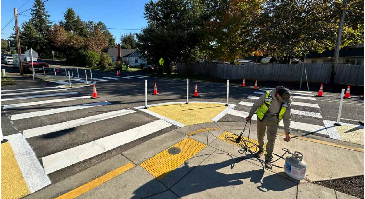
Quick Build completed project in Sweet Home.