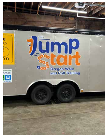
Bike trailer branded with program logos.