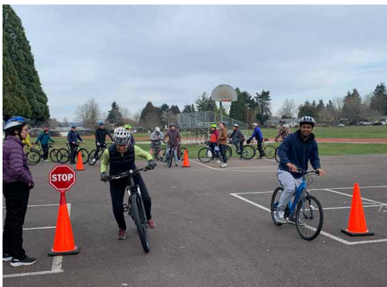
Corvallis School District teachers and volunteers participate in Jump Start training.

Publication of bicycle and pedestrian Jump Start curriculum for PE teachers and bicycle and pedestrian education Drill Guides