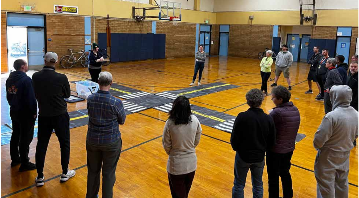
Corvallis teachers and volunteers participate in pedestrian safety training.