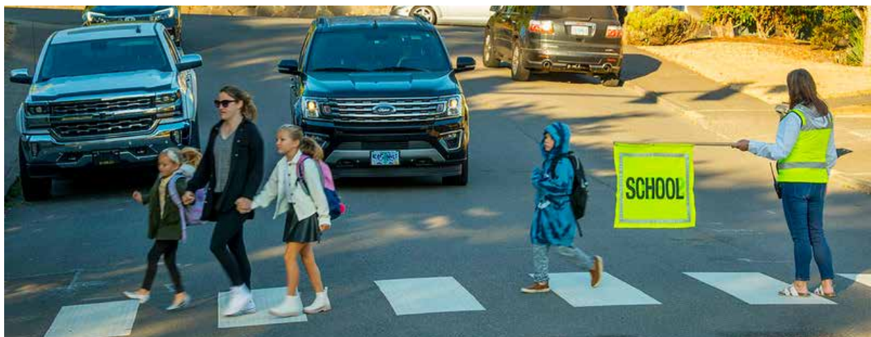
Oregon students crossing the street.

Information will be online at OregonSafeRoutes.Org and provided through webinars and Hub meetings.