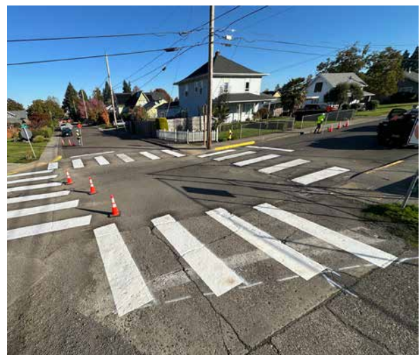
Quick Build completed project in Mt. Angel.