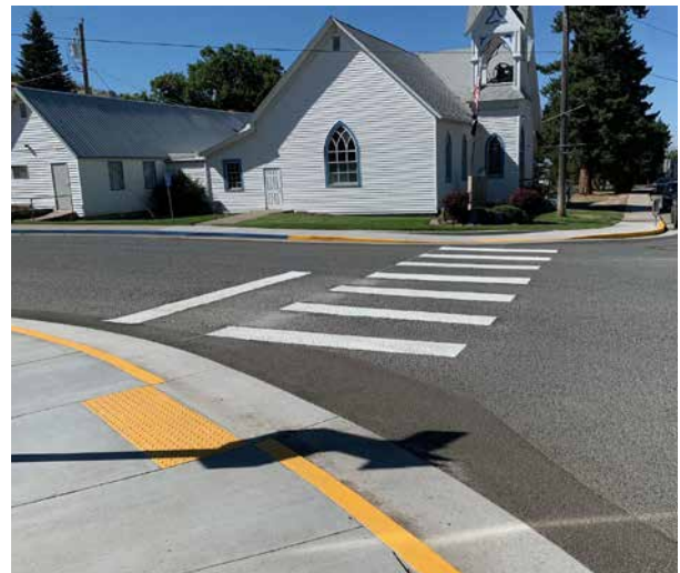
Quick Build completed project in Cove.

The Additional Engineering pilot program bridged Planning Assistance to the Construction Grant process through assistance with design work and implementation of lower-cost improvements. The program prepares rural and small communities in readiness for Competitive Construction Grants and other sources of funding for active transportation projects. Select communities participated in the pilot phase, and in 2024 this support will be available to all communities who have gone through Planning Assistance.