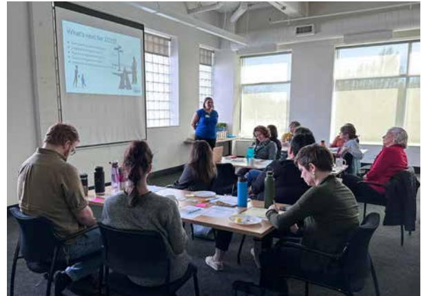
SRTS practitioners gather for the 2023 Annual Meeting in Portland.