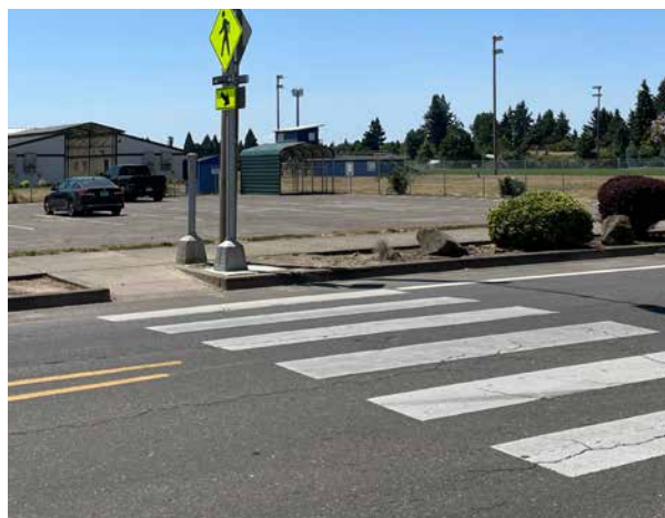
City of Gervais completed SRTS construction project.