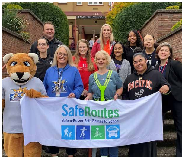
High school students in Salem support Ruby Bridges Walk to School Day event

SRTS in Oregon now includes high schools! In the next year, ODOT SRTS will launch a high school SRTS program that will include leadership programs, collaboration with other practitioners and student groups, and partnerships with organizations across the state that work with teens. Want to get involved or make a suggestion for this new program? Contact us at Info@OregonSafeRoutes.Org .