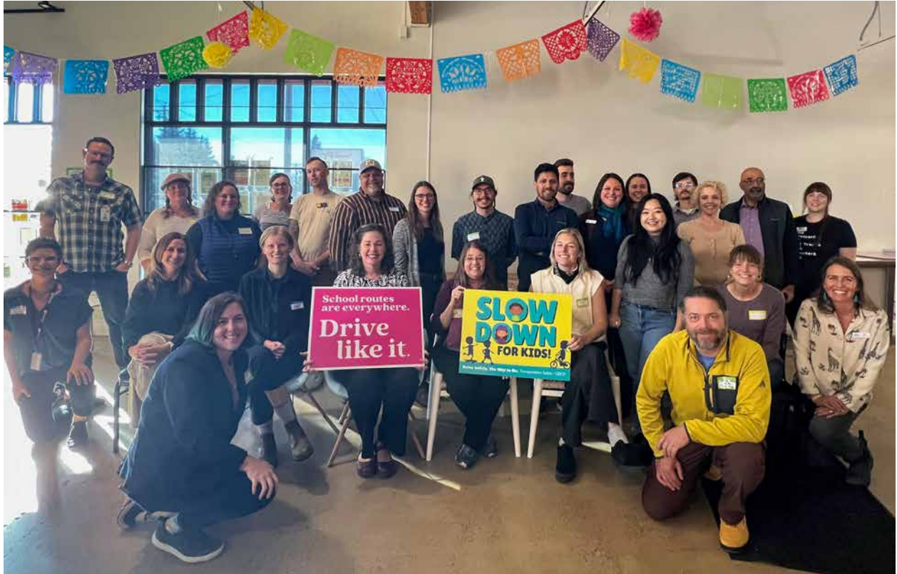
Safe Routes Advisory Committee gathers for in-person site visit to bike works by pear.

In October, the Safe Routes Advisory Committee (SRAC) participated in a visit to bike works by p:ear to learn about the East Multnomah County SRTS program run in partnership with bike works by p:ear, Multnomah County, and the Cities of Gresham and Portland. This region is one of the highest need areas of the state, so it was an important community for SRAC members to visit and see the impact education programs can have. Attendees learned about the wider context of SRTS education programming, how it's implemented in East Multnomah County, and the many challenges the County faces." "The attendees also saw demonstrations of pedestrian and bike safety education as well as a new traffic playground.