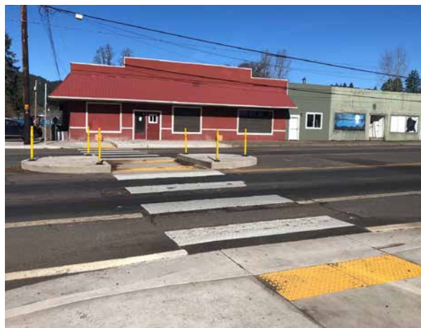
City of Albany completed SRTS construction project.

The Construction Program is expanding its reach in another way: In the past, to be eligible, projects needed to be within one mile of a public school. Starting with the 2024 grant cycle, projects may be up to two miles from a public school. This means more schools will be eligible and new types of projects can be funded, such as Safe Routes to Bus Stops.