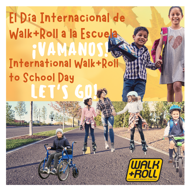
Download Facebook, Instagram, Instagram Story, Twitter.