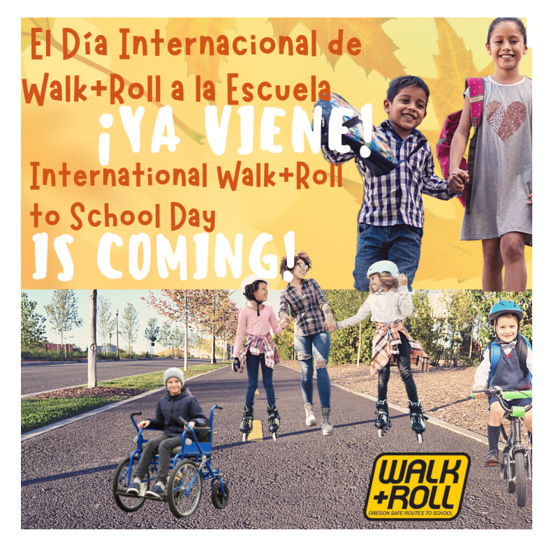
Download Facebook, Instagram, Instagram Story, Twitter.