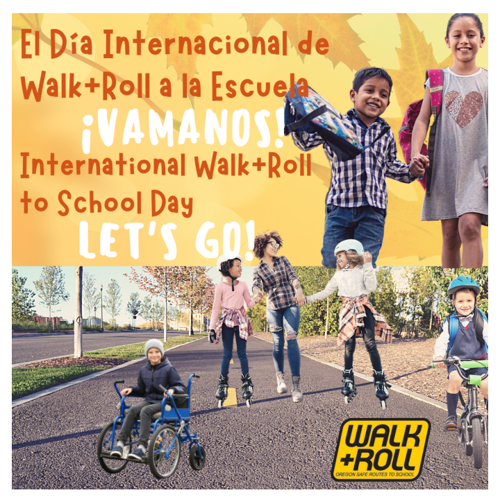
Download Facebook, Instagram, Instagram Story, Twitter.