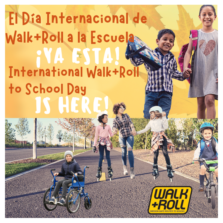
Download Facebook, Instagram, Instagram Story, Twitter.