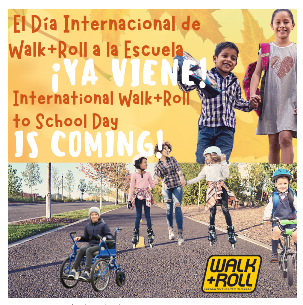
Download Facebook, Instagram, Instagram Story, Twitter.