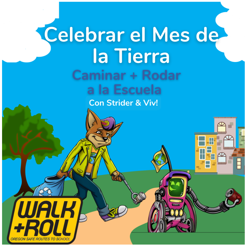
Download Spanish here.

Text - Spanish: El mes de la tierra ¡Ya esta! ¿Sabías que caminar y rodar a la escuela es bueno para tu salud física y mental? También mantiene la Tierra saludable al reducir las emisiones de carbono en el aire. Todos podemos ayudar a proteger la tierra haciendo cambios en la forma en que viajamos. Hashtags: #walkandroll #earthmonth #saferoutestoschool #oregonsaferoutes #oregonearthmonth