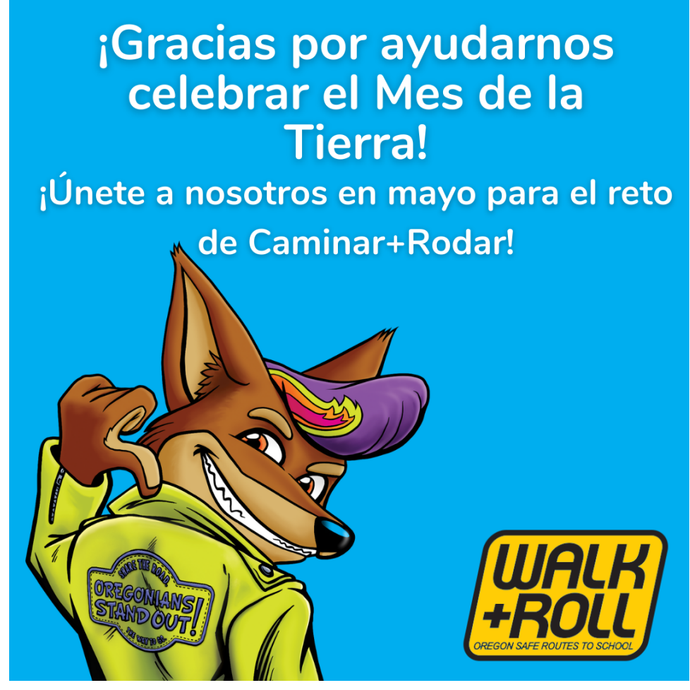
Download Spanish here.

Text - Spanish: ¡Que bueno este Mes de la Tierra! ¿Caminaste o rodaste a la escuela este mes? Si es así, no te detengas. Puedes continuar caminando y rodando en mayo para el reto de Walk+Roll. ¡Puedes caminar y rodar todo el año!