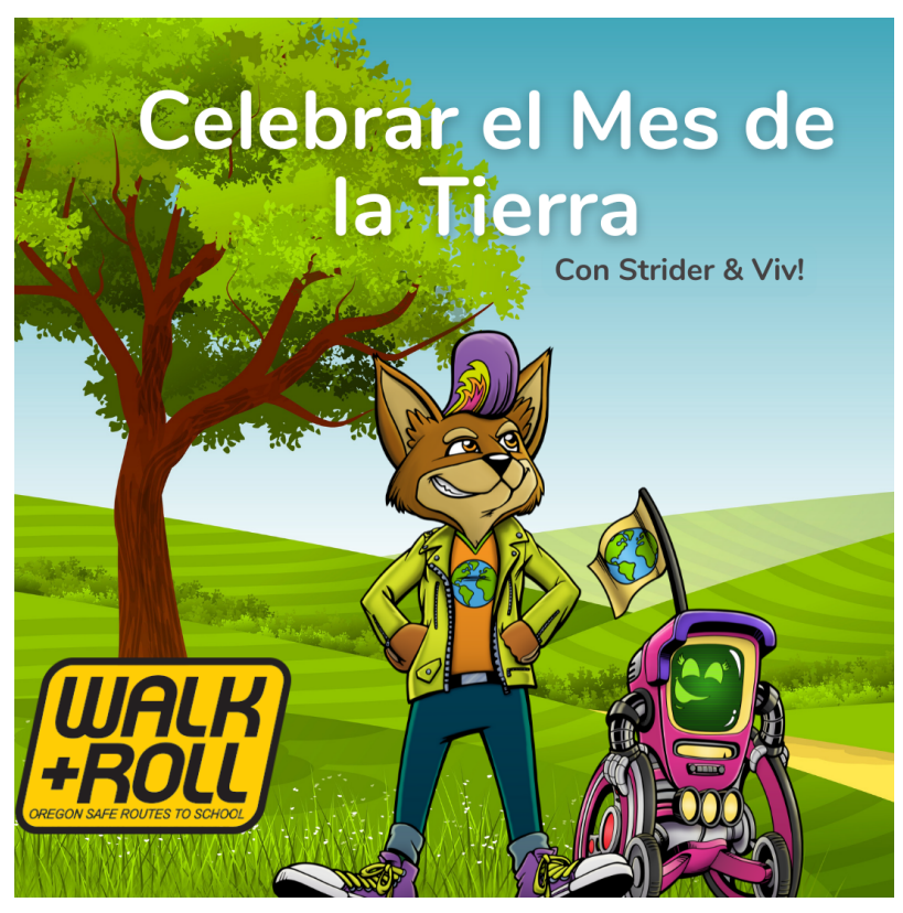
Download Spanish here.

Text - Spanish: Mes de la Tierra ¡Ya viene! El 22 de abril es el Día de la Tierra, vamos a caminar y rodar a la escuela todo el mes para celebrar la tierra. Ayuda a que la comunidad y el planeta sean saludables. ¡Camina y rueda a la escuela con nosotros!