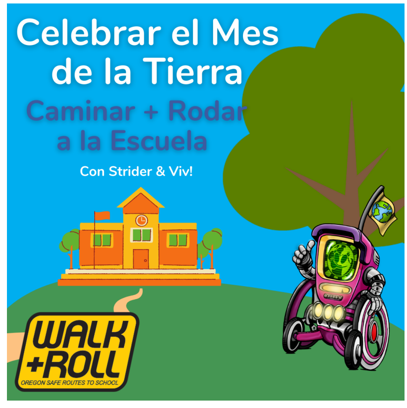
Download Spanish here.

Text - Spanish: El mes de la tierra ¡Ya esta! ¿Usted y su familia tienen planes de caminar o rodar a la escuela este mes? Caminando y rodando a la escuela beneficia nuestra salud mental y física, al mismo tiempo que ayuda a reducir las emisiones de carbono. Apoya la tierra, únete [el nombre de la escuela o la comunidad] caminando y rodando a la escuela.