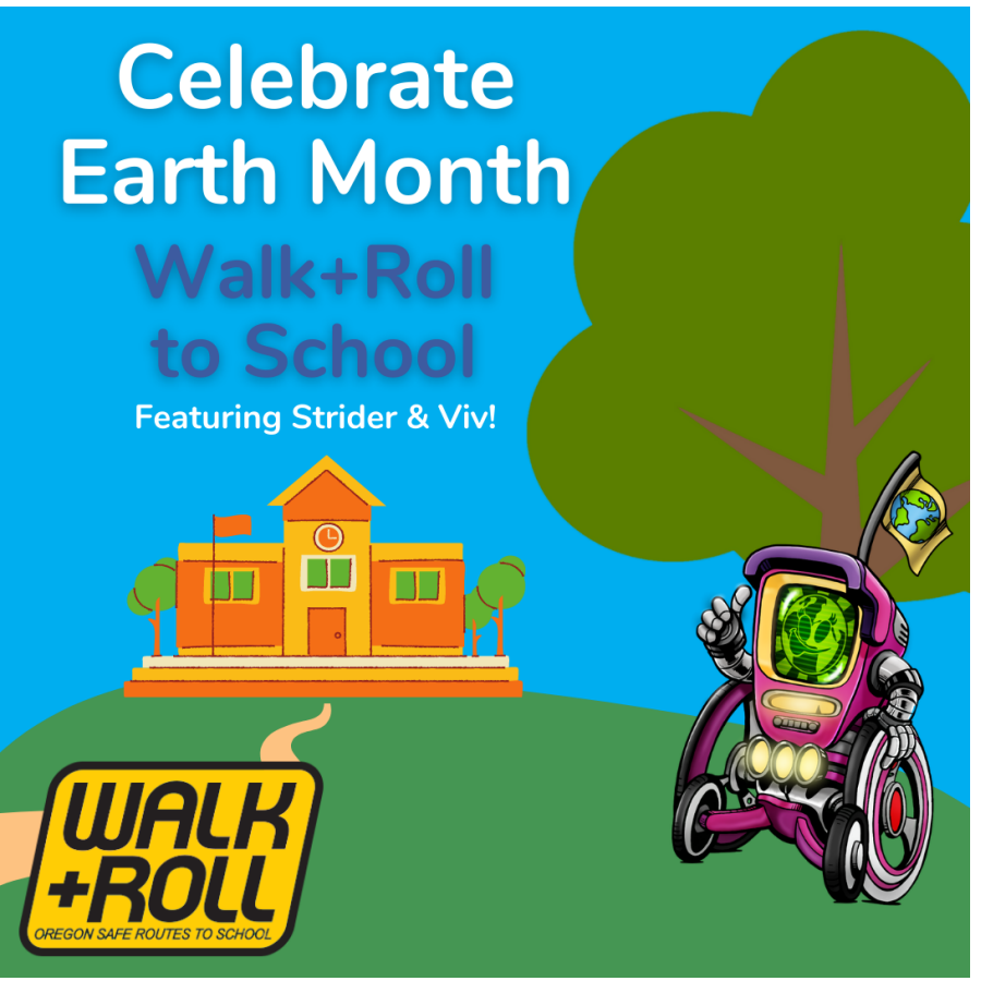
Download English here.

Text - English: Earth Month has started. Do you and your family have plans to walk or roll to school this month? Walking and rolling to school improves our mental and physical health, while helping reduce carbon emissions. Join (school or community name) as we walk and roll to school for the Earth.