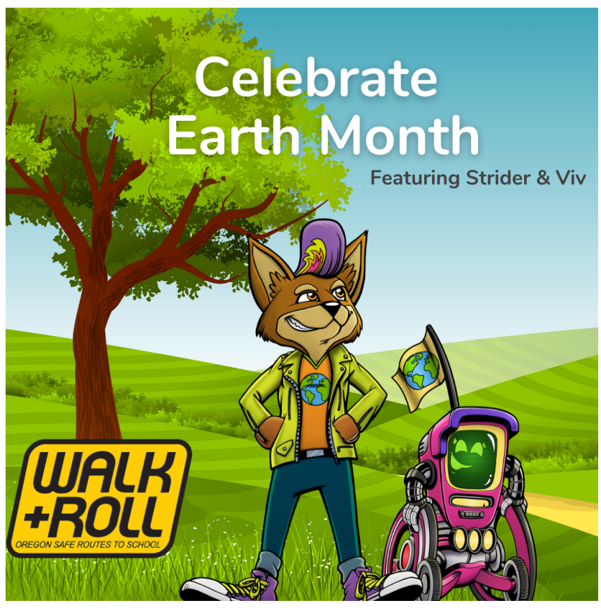
Download English here.

Text - English: Earth Month is just around the corner! Earth Day is April 22nd, but we can celebrate the Earth all month long by walking and rolling to school. Join us as we take steps to make our community and Earth healthier for all by walking and rolling to school!