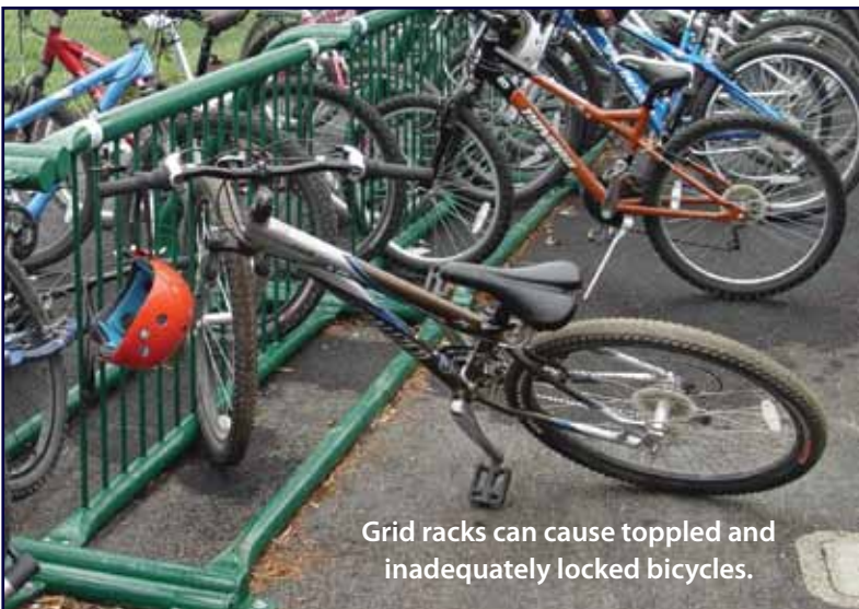
Grid racks can cause toppled and inadequately locked bicycles.

or district to investigate the details of your local formula. This formula should be used as a starting point, and when necessary, bicycle rack capacity should be expanded to accommodate growing numbers of bicyclists.