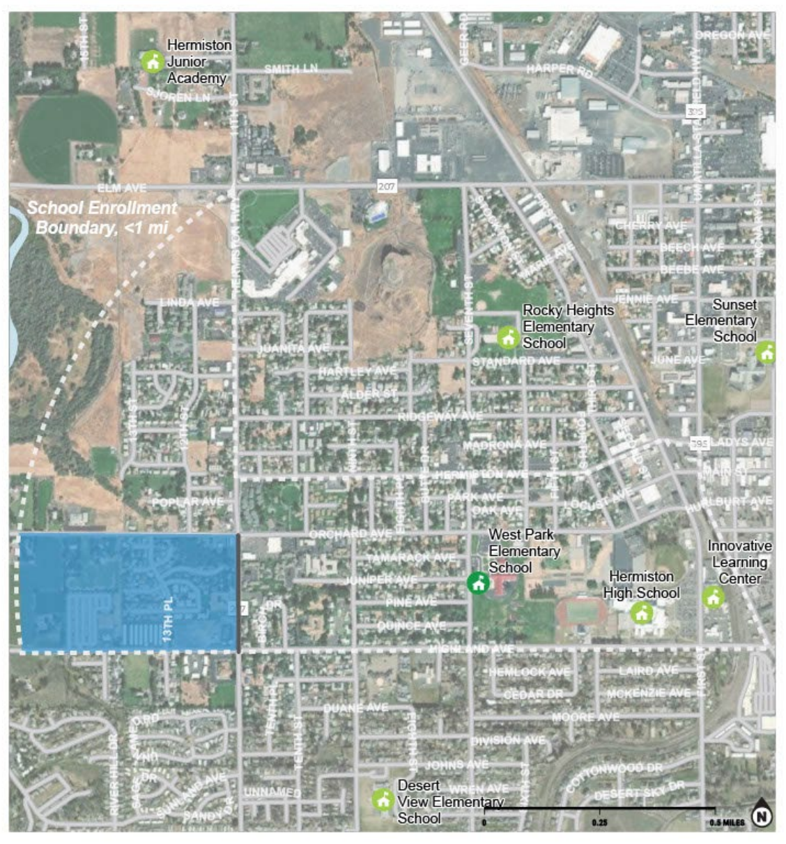
Figure 1. West Park Elementary New Access Area for Students Walking and Biking

West Park Elementary School Students with New Access to Walking and Biking